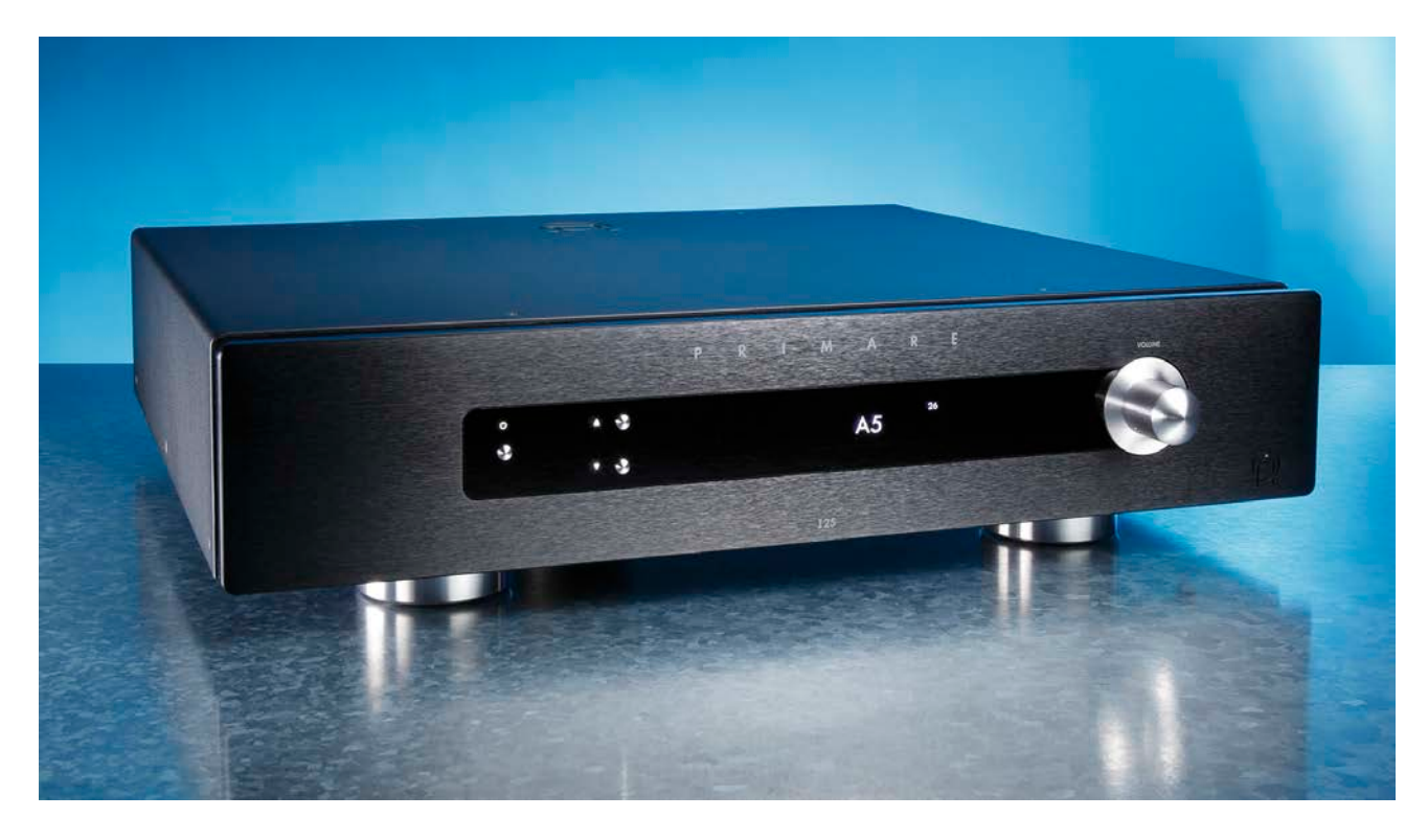
Integrated Amp Test

https://stereo-magazine.com/review/primare-i25-review