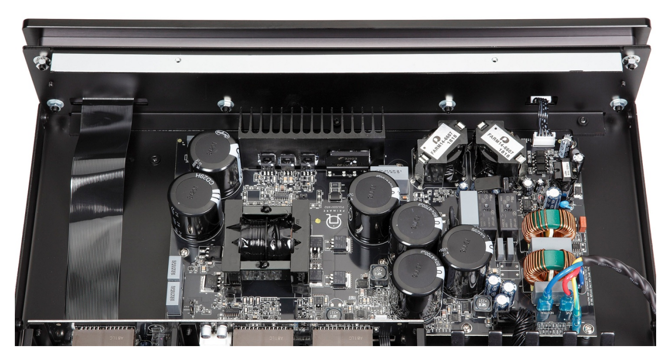
The internal structure is clearly arranged and equipped with a lot of SMD components. The coils can be found in all Class D amplifiers for filtering purposes.

Primare also put a lot of effort into using the experience gained in the last ten years with Class D technology for further development. Also the knowledge gained from producing the tube amps from Copland helped in this process. With the UFPD 2 circuit, Primare believes to have achieved the difficult balance between amplifier and filter stage by merging the two units. The difficulties of limited and, depending on the loudspeaker, varying bandwidth otherwise often encountered with Class D amp are said to be a thing of the past thanks to this power supply design. Also distortion and noise components have been further reduced, amongst others by shortening the signal paths.