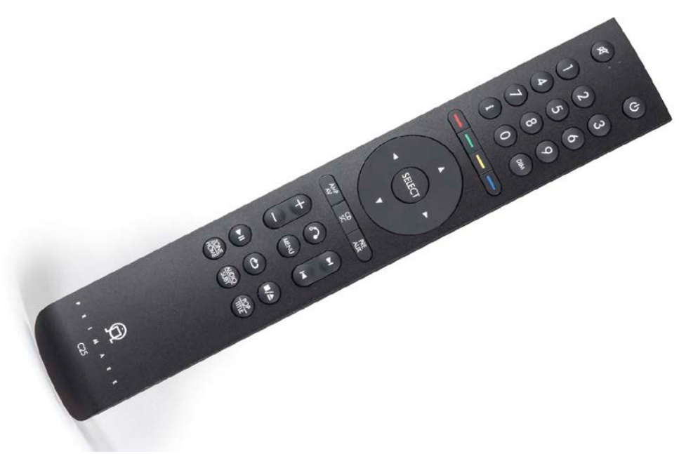
The remote control is clearly arranged and feels handy.

recording from the year '61 under Erich Leinsdorf was emotionally gripping and showed the stage in all its breadth. The same holds true for Noon's "500 Miles". The bottom line is that the Primare I25 is a piece of great Swedish workmanship, that is a lot of fun in every respect.